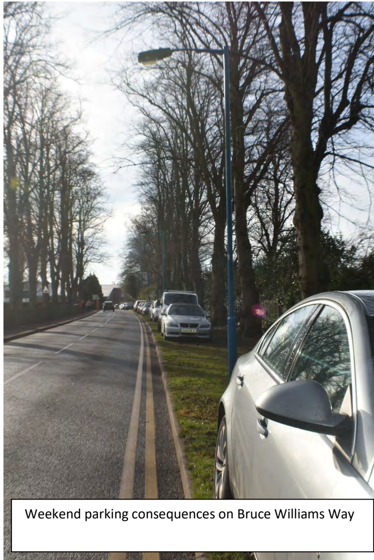
Weekend parking consequences on Bruce Williams Way