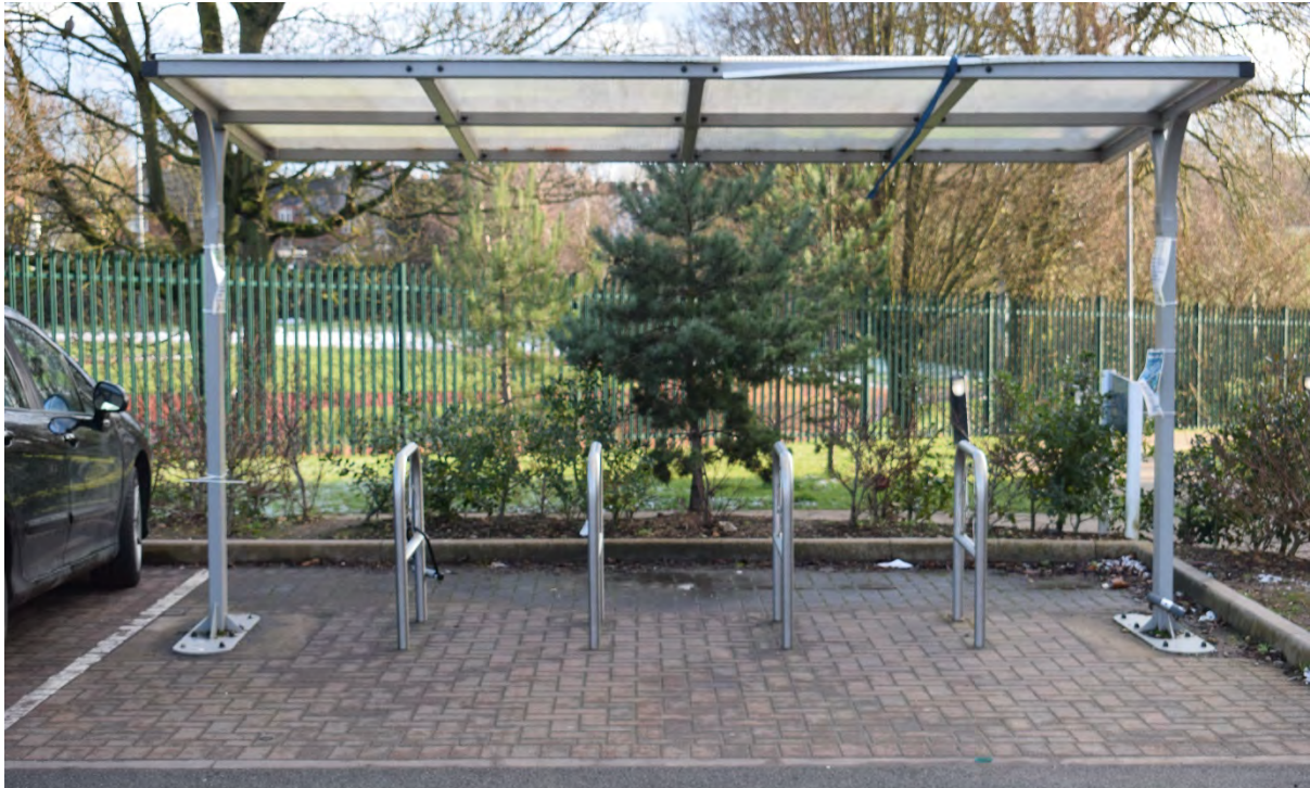
Current cycle shelter – option to relocate to gain x2 spaces