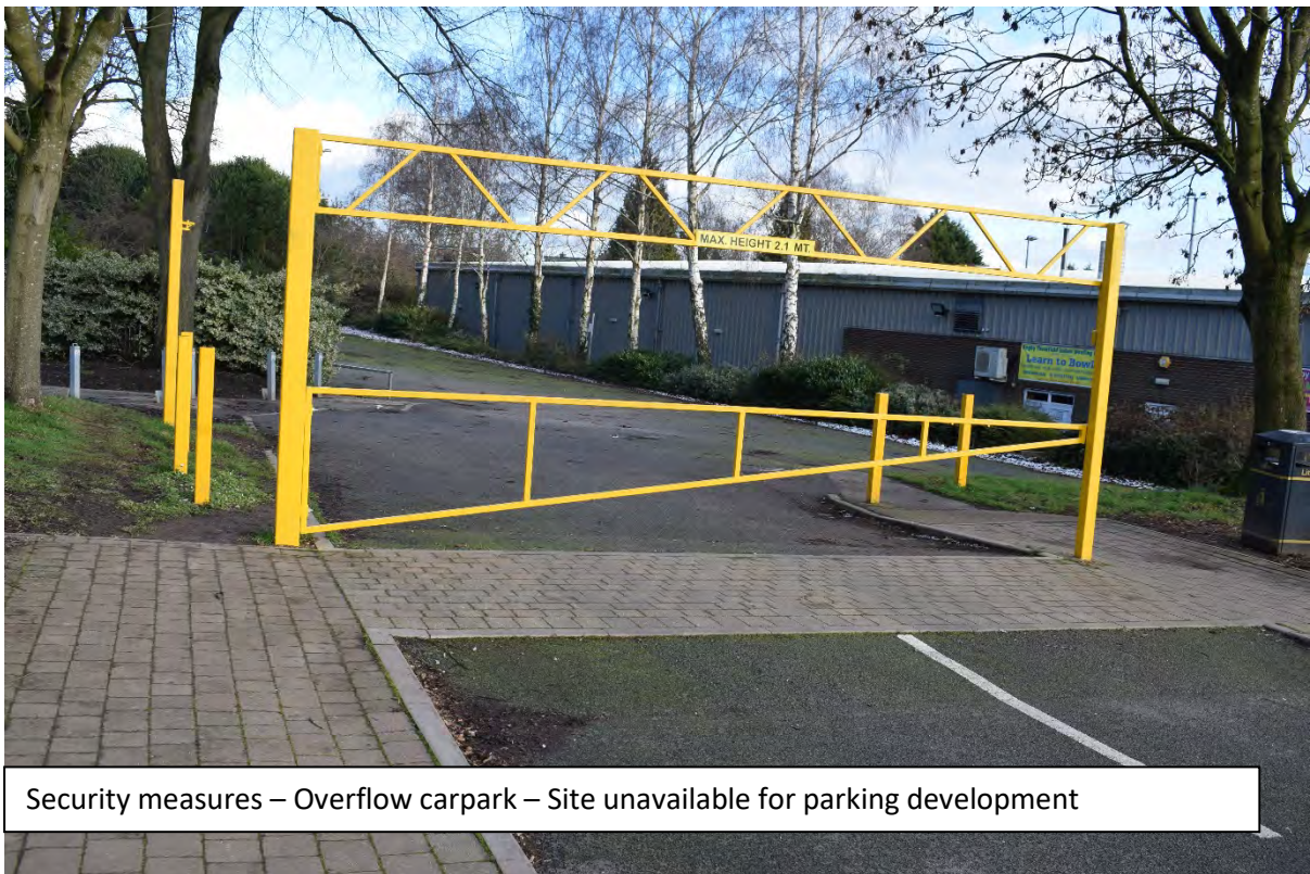
Security measures – Overflow carpark – Site unavailable for parking development