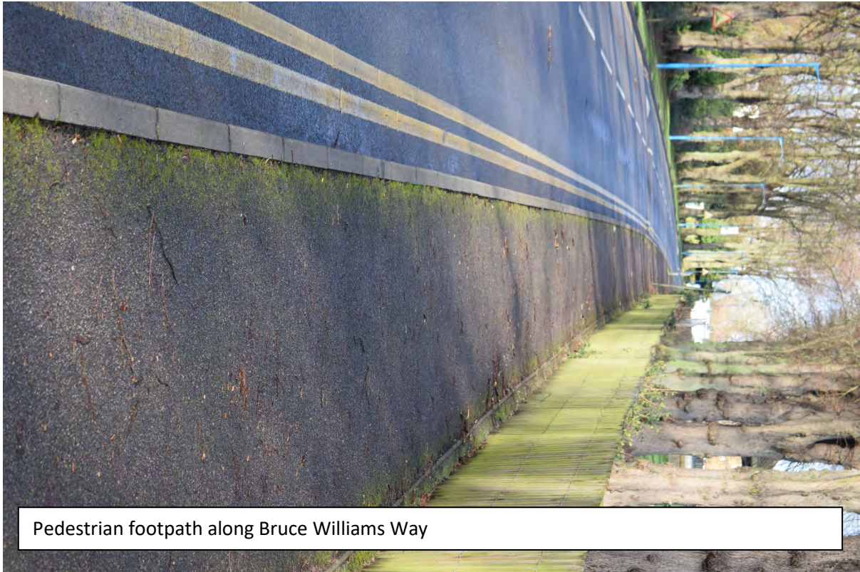
Pedestrian footpath along Bruce Williams Way