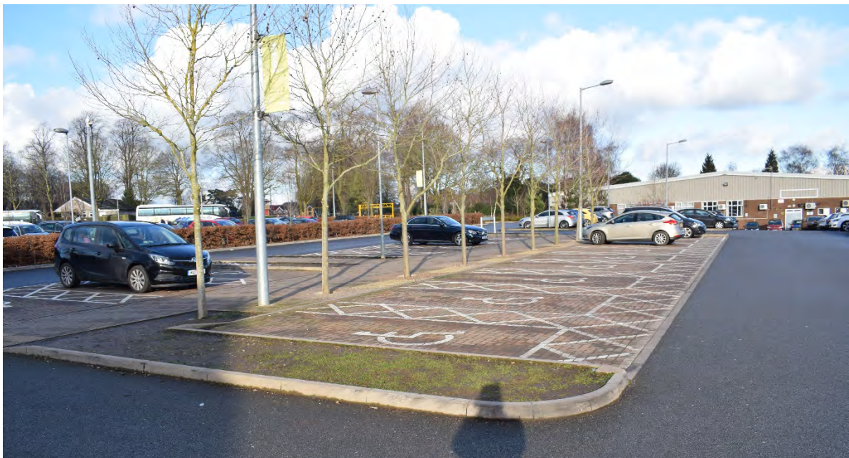
Current Disabled bays x17 Option 1 – Reduce to 10-12 Option 2 – Reallocated a prescribed number to parent/toddler