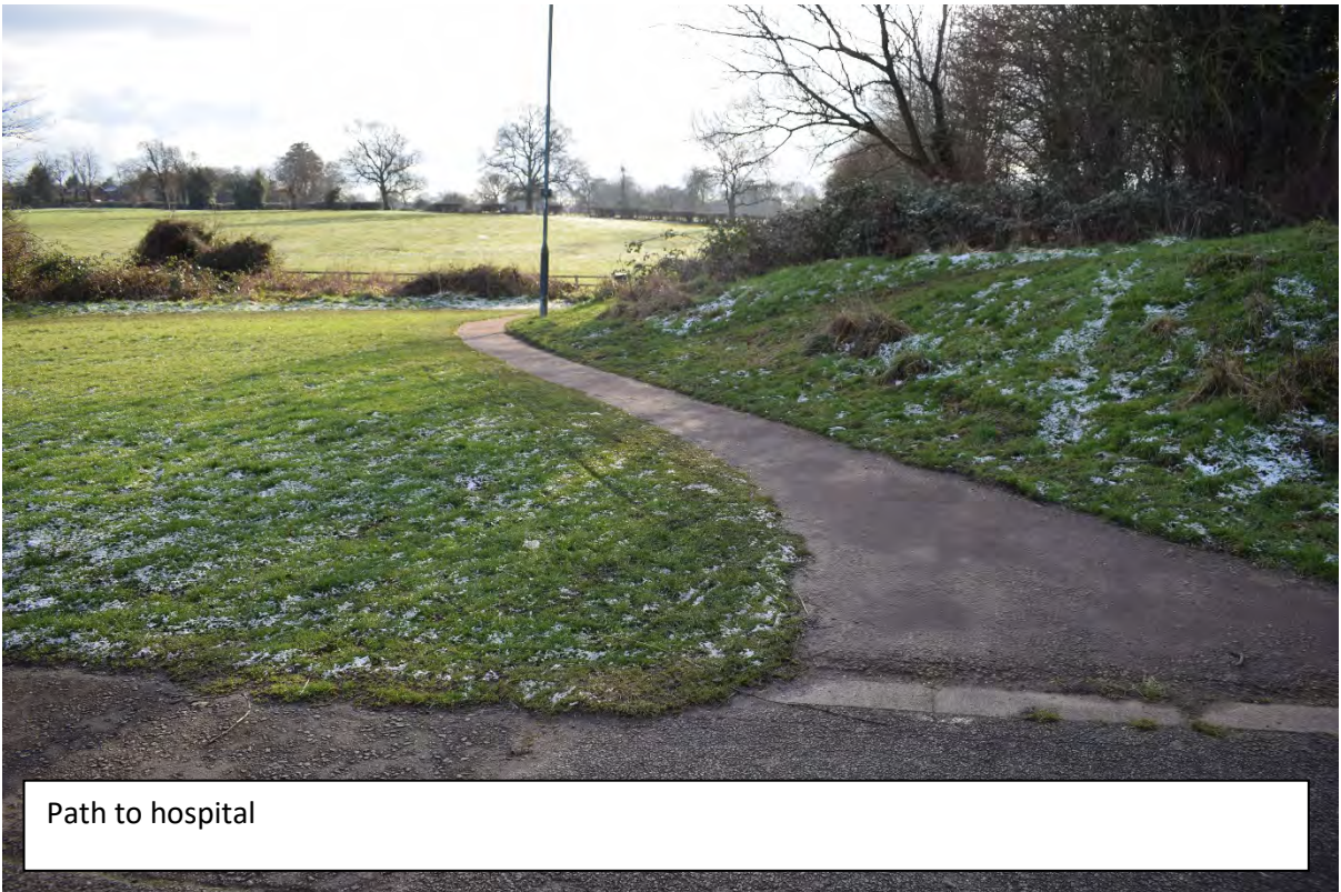
Path to hospital