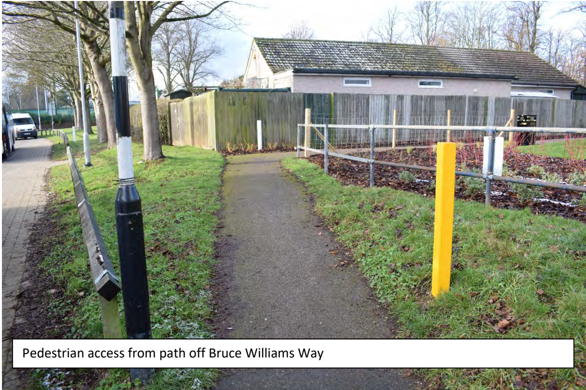
Pedestrian access from path off Bruce Williams Way