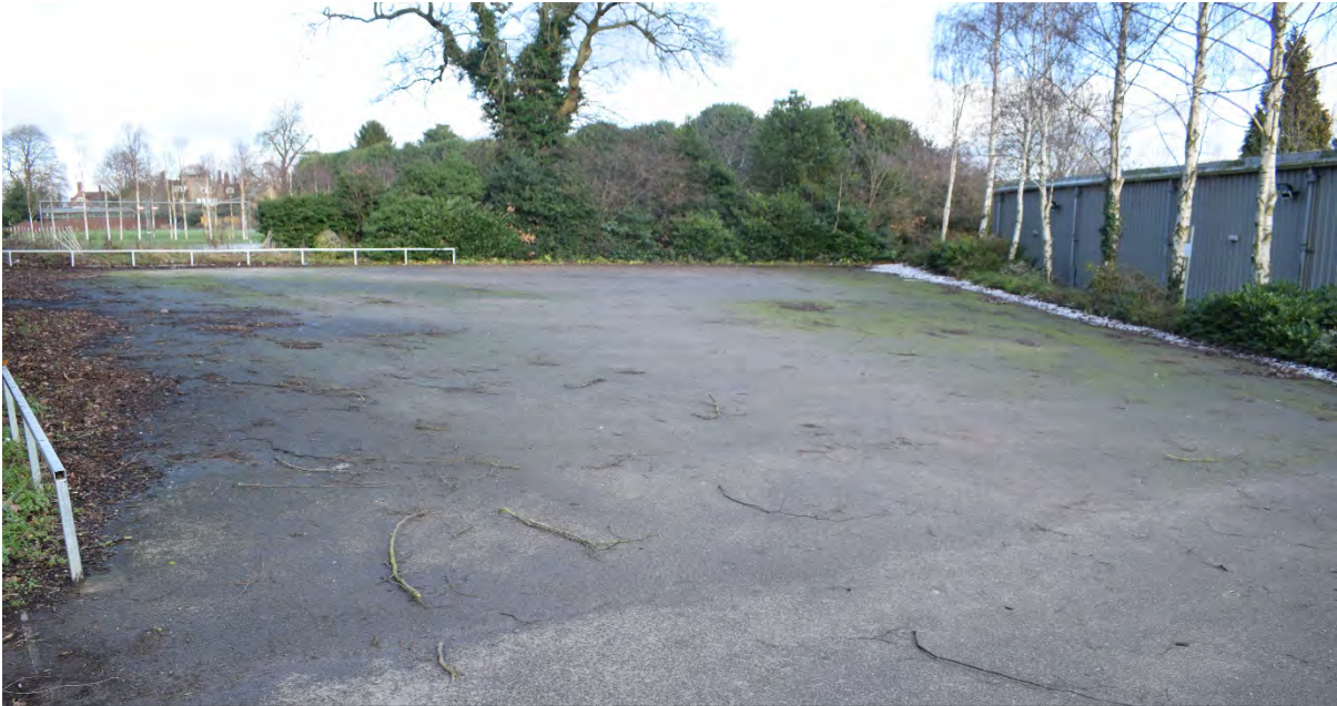
Overflow Carpark within Whitehall Rec – RBC Would require lease of area to GLL – GLL have stated they would want RBC to mark and install lighting completed before they would lease