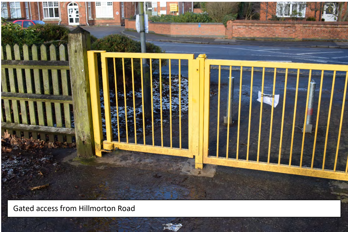
Gated access from Hillmorton Road