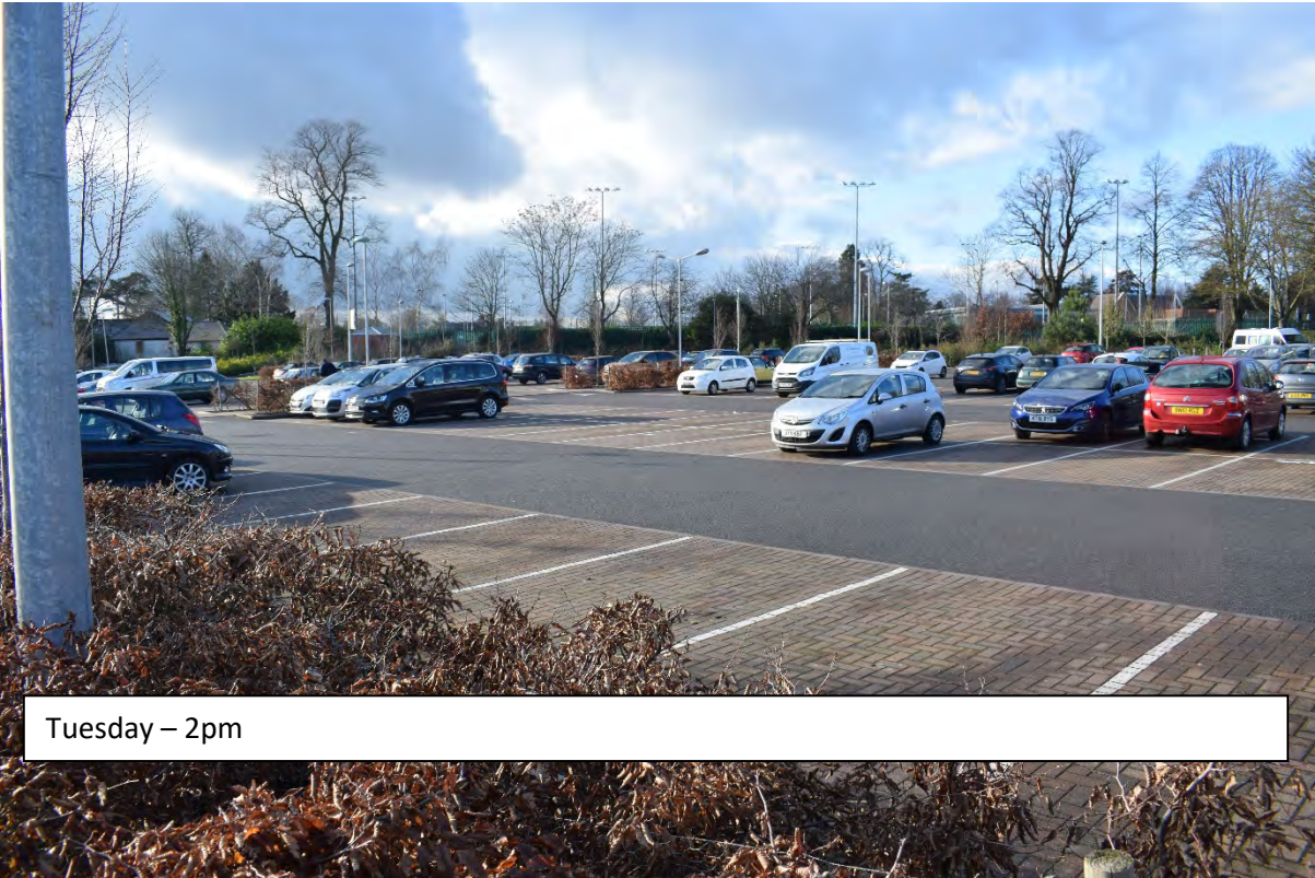
Tuesday - 2pm