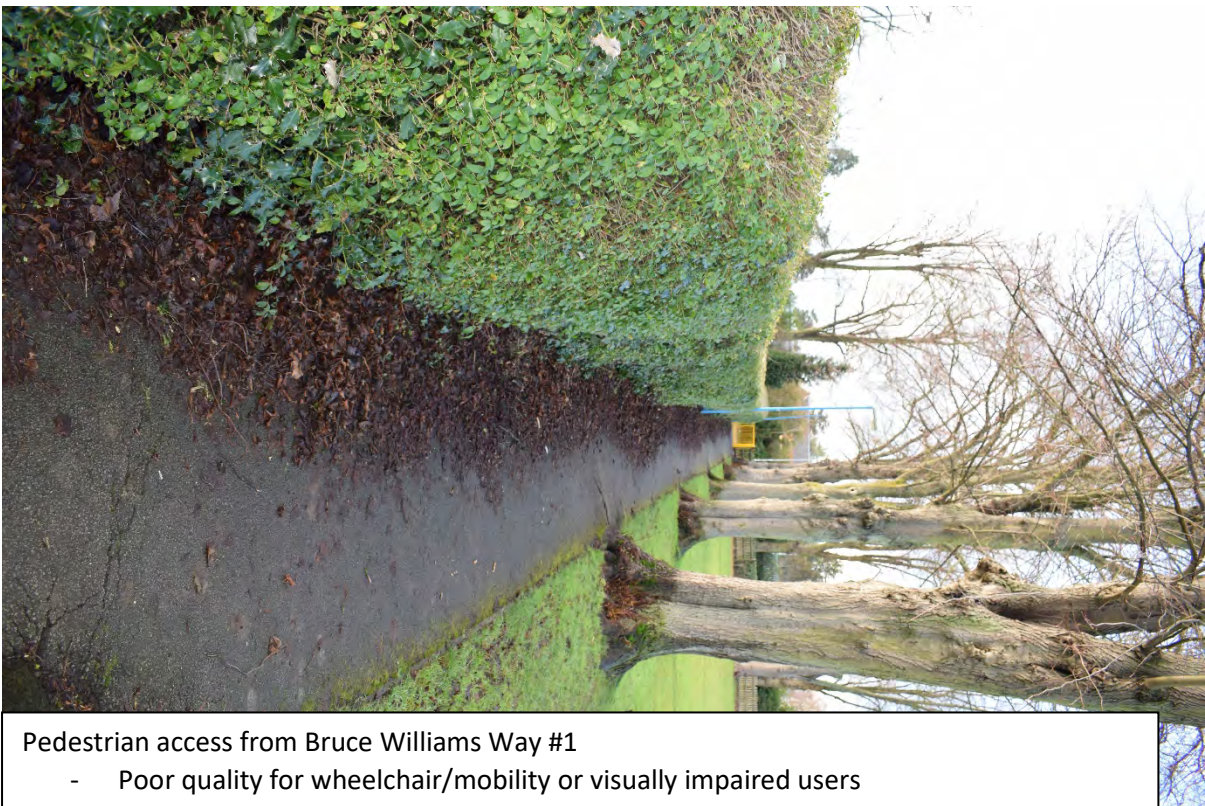
Pedestrian access from Bruce Williams Way #1 - Poor quality for wheelchair/mobility or visually impaired users