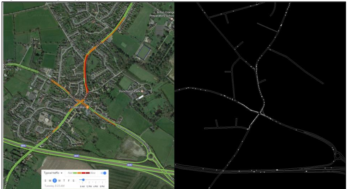
Figure 2 – Google Typical Traffic vs Model Snapshot (Dunchurch Crossroads: 0830)